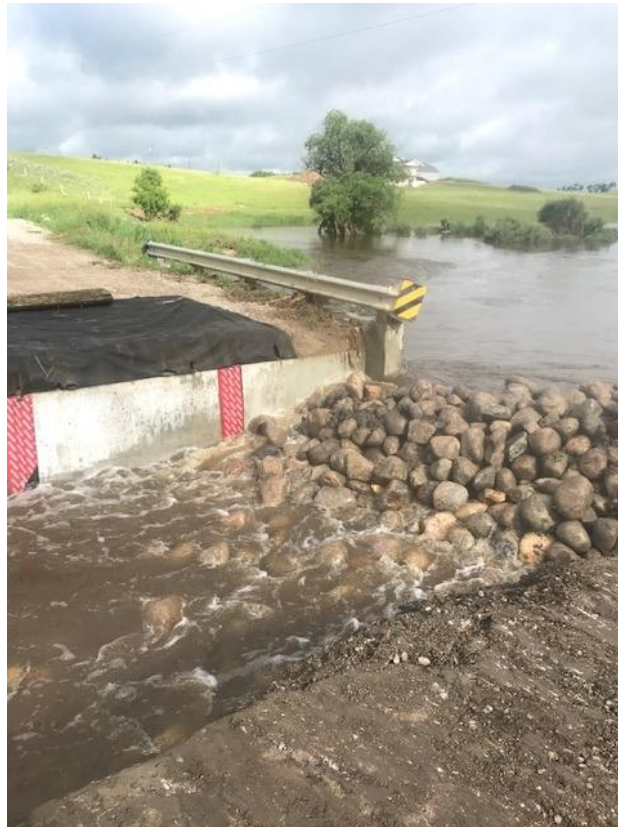
Site#4 Rd61 Paradise Valley Box Culverts

Site#4 – Paradise Valley Bridge. West of Rd 114 on Rd 61